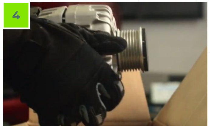
Step 4. Prepare the new Valeo alternator.