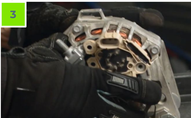
Step 3. Pull out the old alternator from the vehicle.