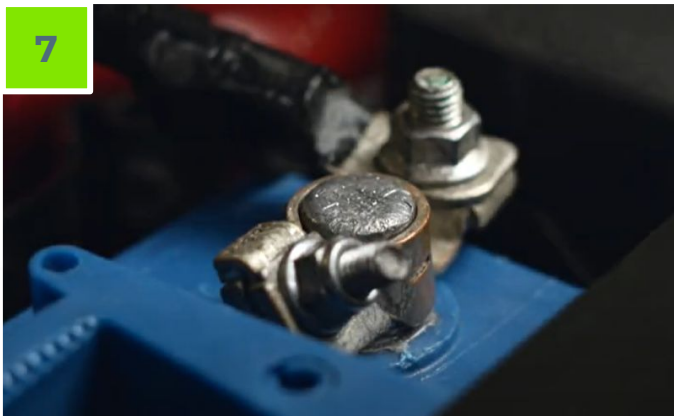
Step 7. Connect the negative battery cable.