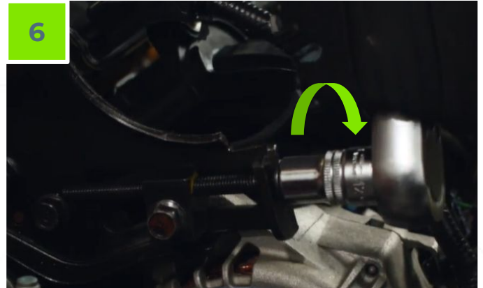
Step 6. Install the alternator belt then fasten the belt tensioner based on manufacture torque recommendation then connect alternator connector.