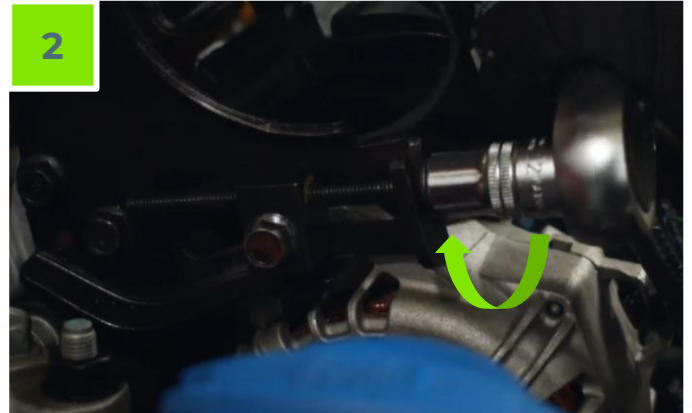
Step 2. Disassemble the alternator belt to disconnect the alternator connector.